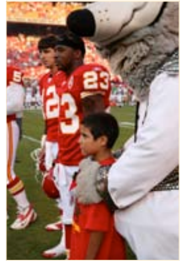
Game Day photos courtesy of Corie Phillips, Brown House Images.