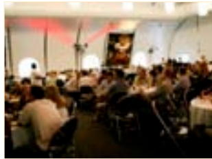
Competitors pack the Pavilion for the June 26 Trivia Night.