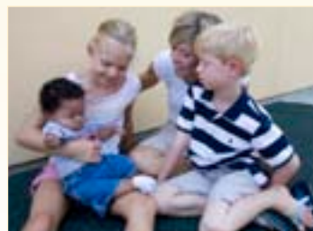
The Stowers family